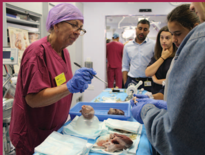
▲ Surgical assistant, Harefield Hospital theaters open day