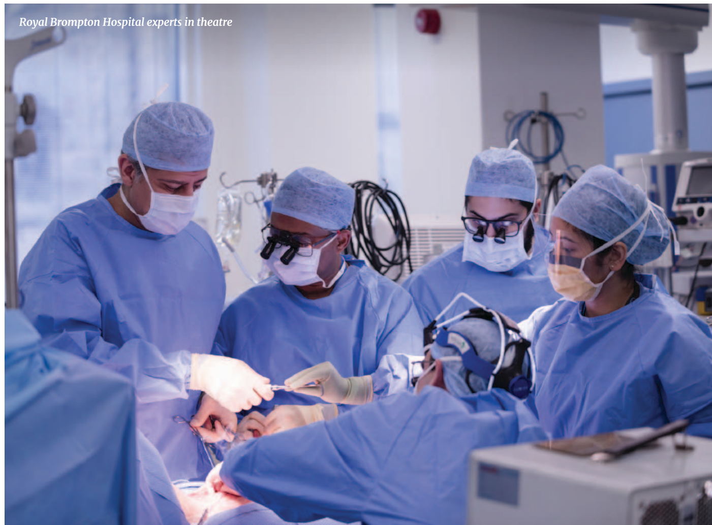
Royal Brompton Hospital experts in theatre